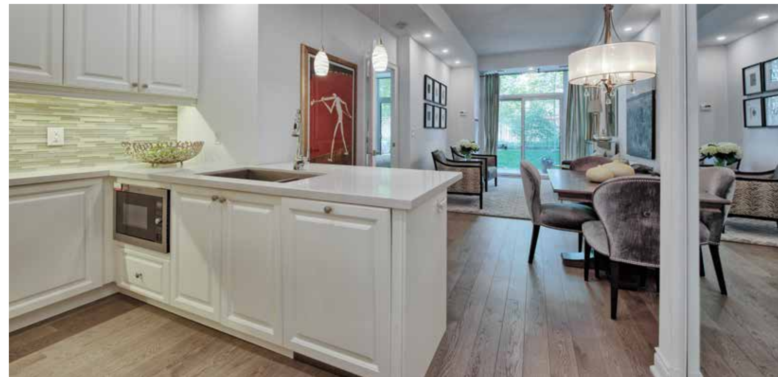
FOYER & KITCHEN