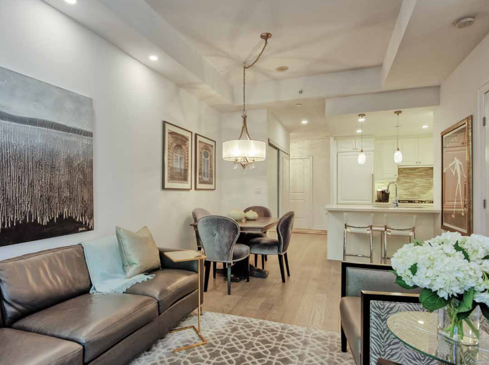
LIVING & DINING ROOM